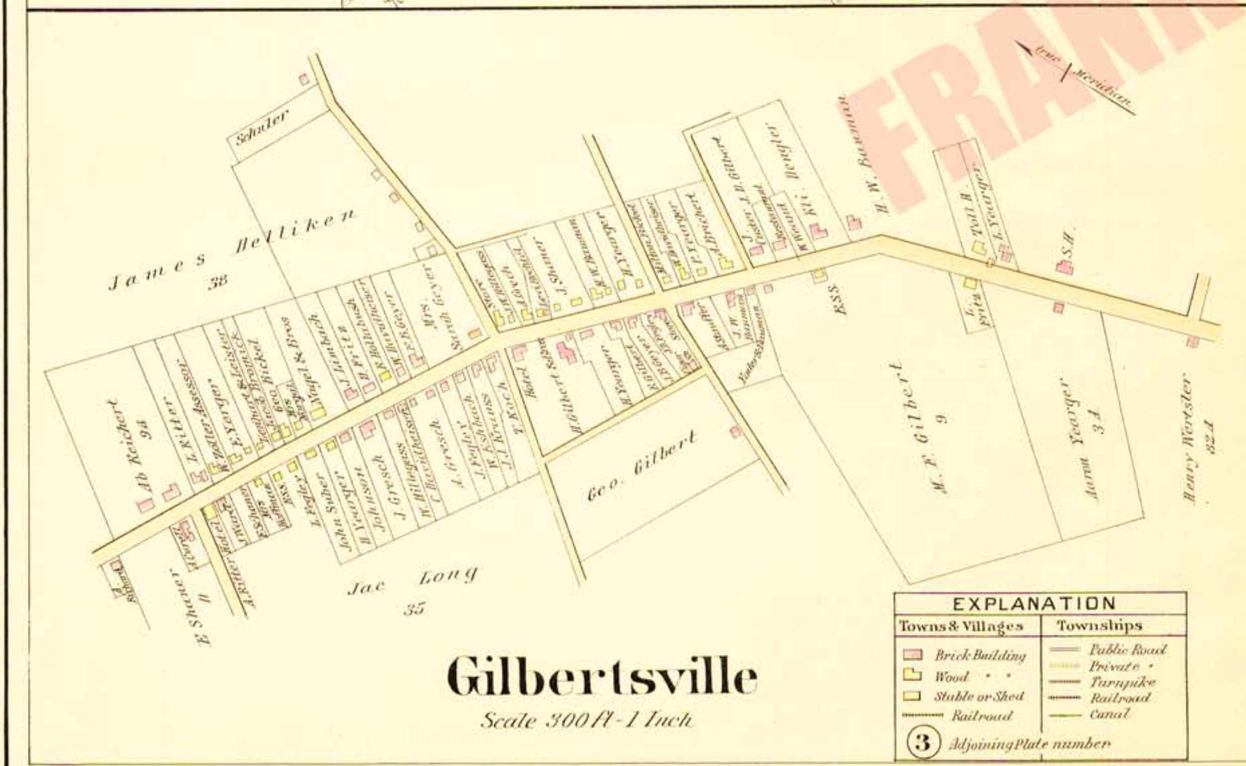
Gilbertsville Scale 300 ft. - 1 Inch