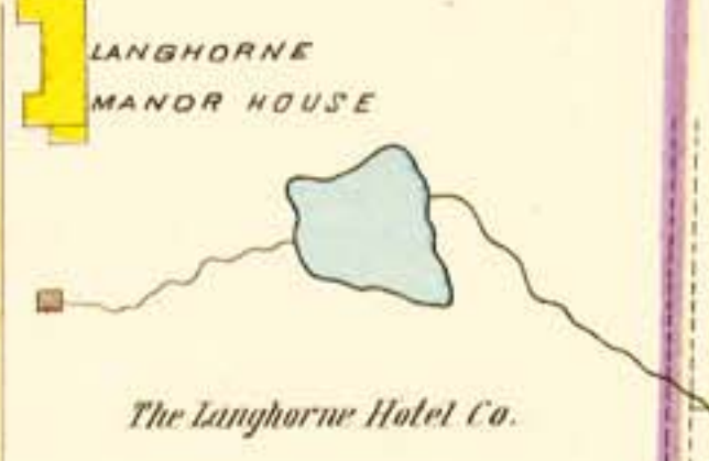
The Langhorne Hotel Co.