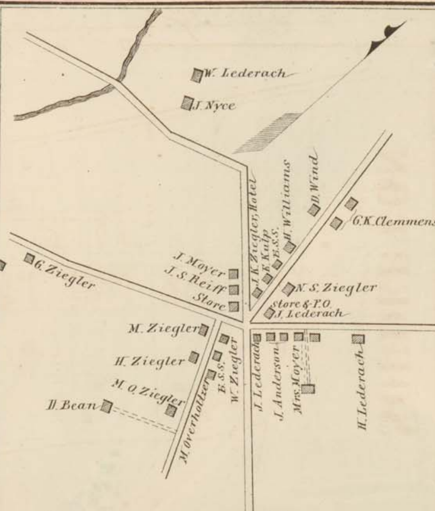
Scale 6 in per mile