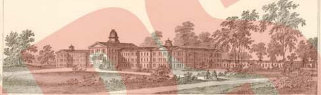
NEW PENNSYLVANIA HOSPITAL FOR THE LUNATIC.